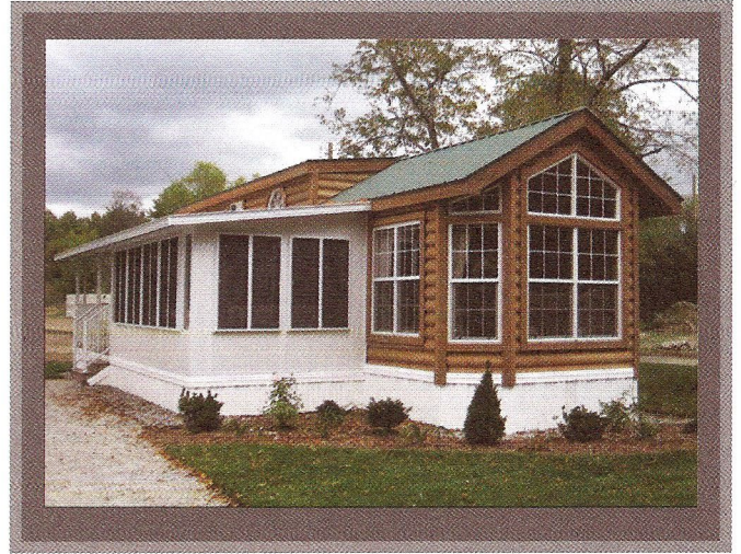
The Day Bed Double Loft Plan

is perfect for those with storage and extra sleeping space in mind. The two additional lofts allow children a place all their own, with outlets for TVs or video games on rainy days, as well as a space for bulky skiboats, snowboards, or other sizable gear. Like the Front Day Bed model, the living room easily converts into a second bedroom with its privacy sliding panel and pull out couches. Your fully furnished model features an interior decor that coordinates everything from your furniture to your curtains to the pillow shams in your bedroom. With the table, chairs, fully applianced kitchen, covered deck, and three season room, all you need is a suitcase to enjoy your vacation getaway. This model is also available in a single loft style and with a fireplace in the living room.